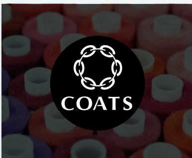
World Textile Leader Deploys Aryaka to Initiate Network Transformation in China

Additionally, Transitex's IT team is able to leverage the 24/7 support team as part of Aryaka's managed services to solve any potential challenges before they become networking issues.